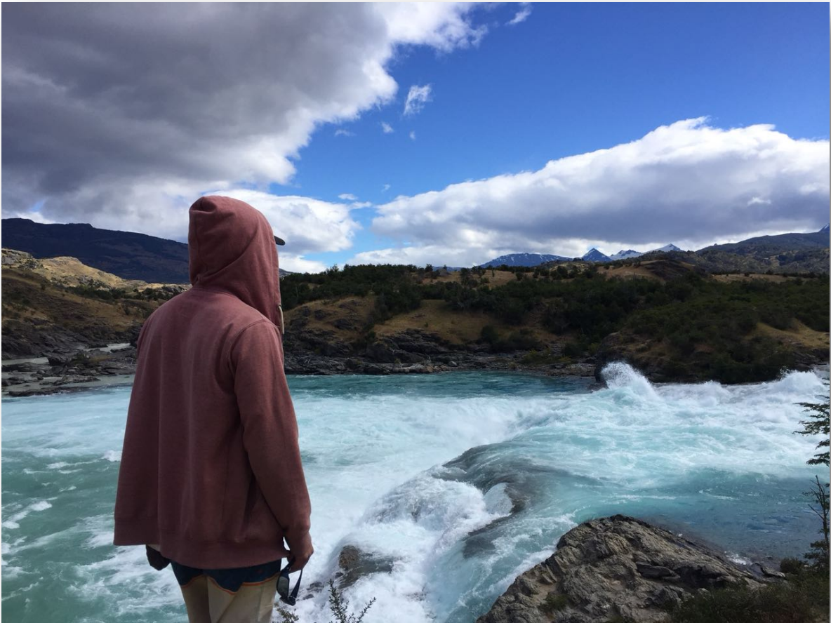
*Rivers Baker and Neff junction point