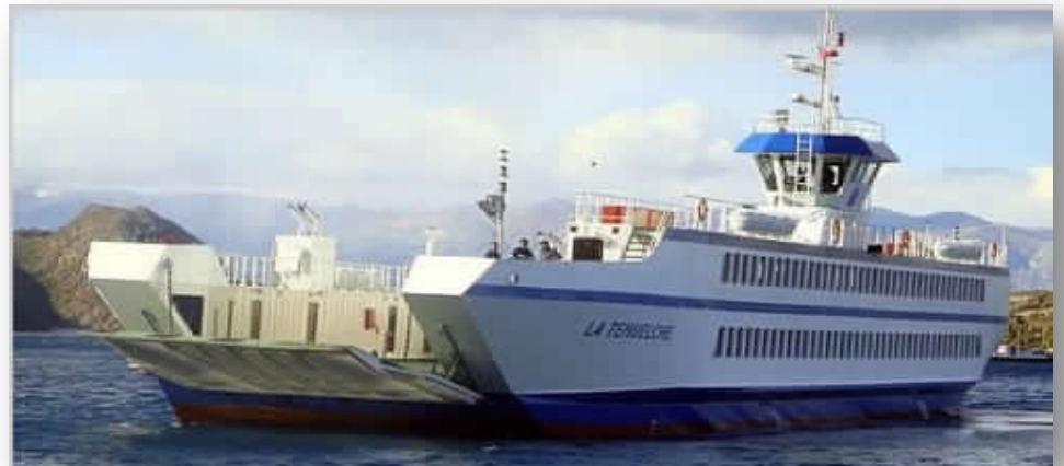
*La Tehuelche ferry