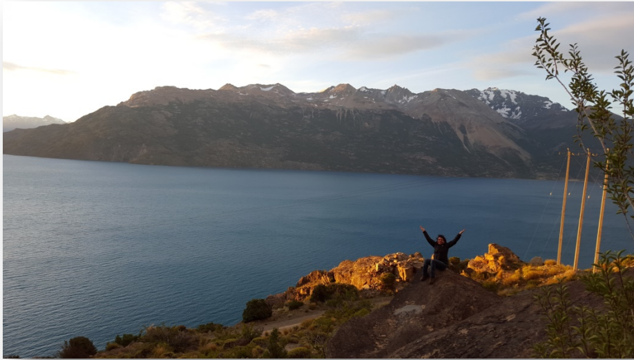
*Las Llaves crossing