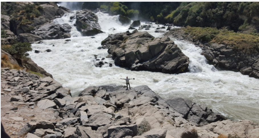
*Ibáñez river waterfall